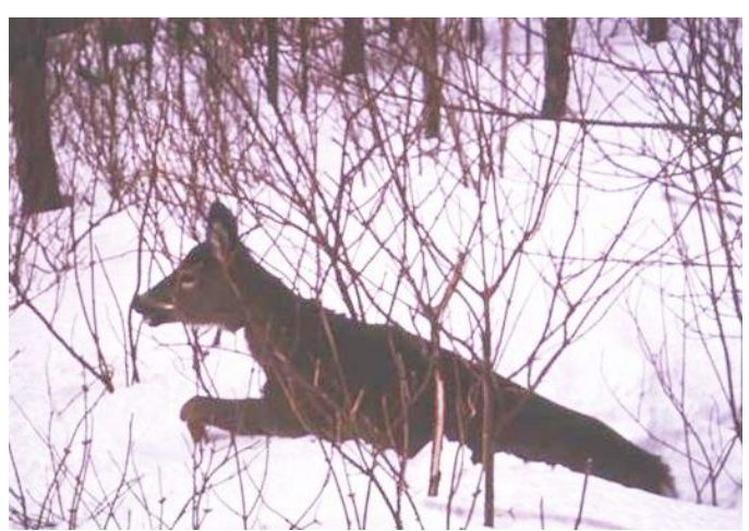
L.D., 823 -- Resolve, To Create an Effective Deer Habitat Enhancement and Coyote Control Program

The working group's findings, recommendations and draft legislation