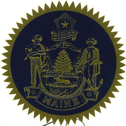
Janet T. Mills Governor

In testimony whereof, I have caused the Great Seal of the State to be hereunto affixed GIVEN under my hand at Augusta this twenty-fifth day of March Two Thousand Twenty