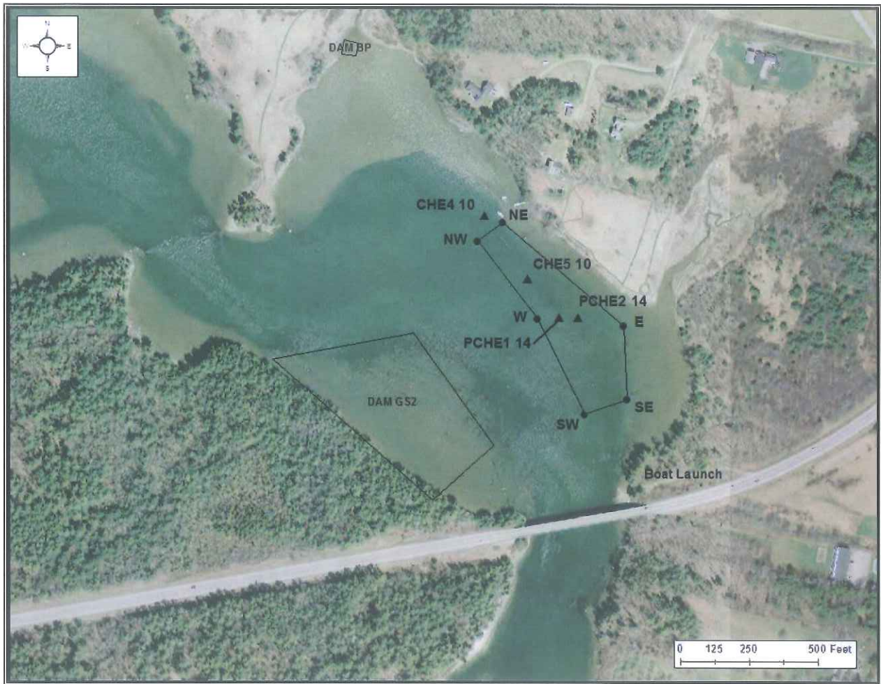
DMR Site Report, Figure 3: Proximity of proposed aquaculture lease site to neighboring farms and shore.

Access to the site can be gained from the launching site at the Damariscotta town landing downriver, from Great Salt Bay to the north, or from a launching area just above the Route 1 bridge south of the proposed lease site. The application notes that the half-mile of river between the bridge and the public boat launch site to the south in Damariscotta village is difficult to navigate, owing to “areas of rapids and swift currents on incoming and outgoing tides, which frequently render navigation hazardous and impossible for all but smaller vessels” (App 10). The application also notes that “The Damariscotta side of the river experiences severe turbulence during incoming tides (Flood). Newcastle’s side is impacted by the outgoing tides” (App 11).