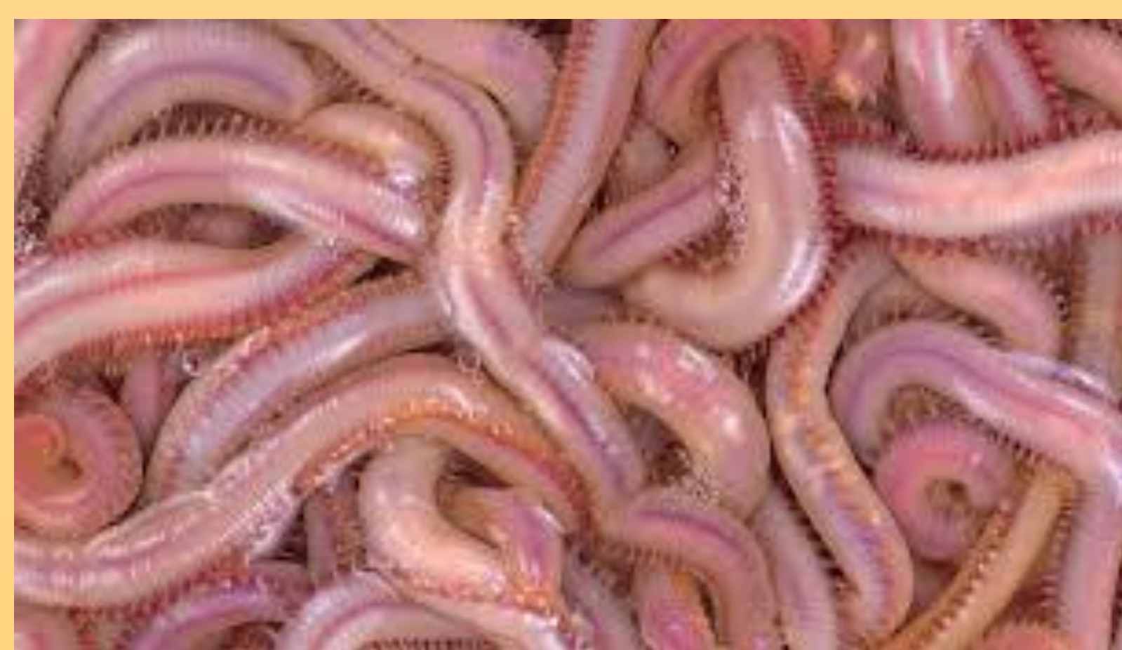
Bloodworm ( Glycera dibranchiata )