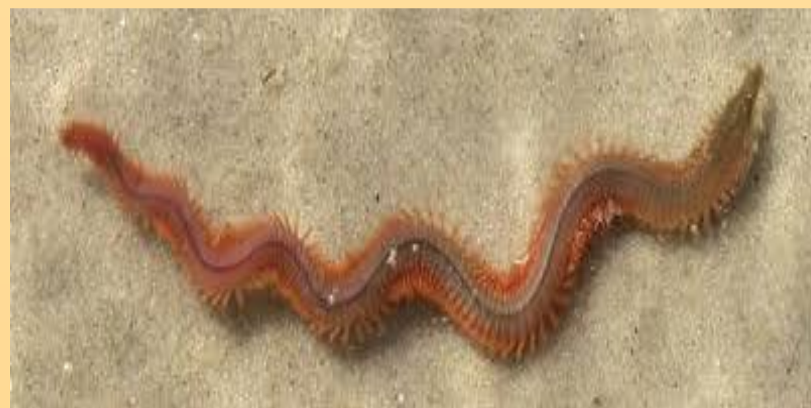
Sandworm ( Nereis virens )