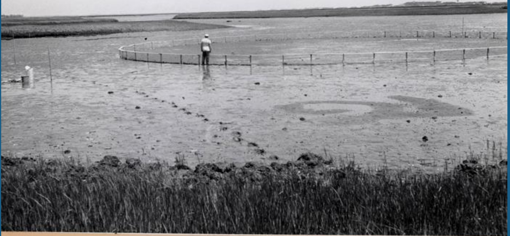
Experimental clam farm protected from crab predators by 300 foot circular fence, Plum Island Sound near Newburyport, Massachusetts, June 1953.

Plum Island Sound Newburyport , Mass 1953