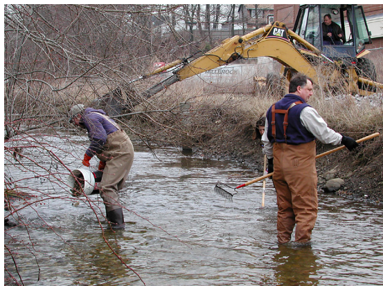
Restoration of spawning habitat in a New England stream. Brad Chase

The regional conservation plan for rainbow smelt may include some or all of the following strategies: