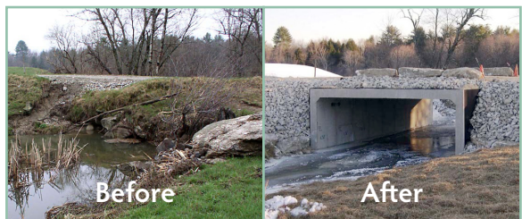
Replacement of culvert that blocked smelt from spawning habitat.

When completed, the conservation and restoration plan will present a comprehensive, regional strategy to address the threats and to restore populations of rainbow smelt in the Gulf of Maine. The plan will identify habitat restoration projects and management actions to be pursued as immediate priorities, and it will propose future projects and collaborations.