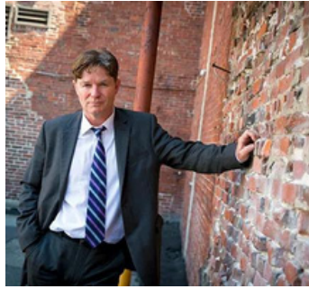
Harvard Gazette 8/28/17