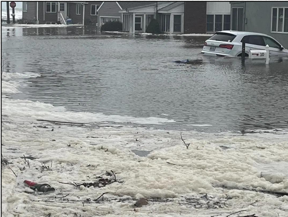
Flooding at York Beach (York Police Department)

Buckled roads, condemned homes, fishery losses: Storm cleanup continues for coastal communities