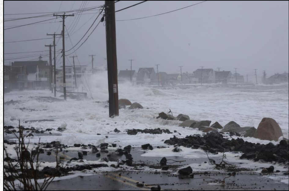
Damage in Wells during a storm on January 13, 2024

Maine coast walloped by flooding amid rainfall, astronomical tides