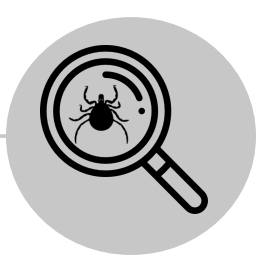
Do daily tick checks and check your pets too.