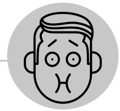
Nausea and Vomiting

Signs and symptoms also include abdominal pain, dark urine, clay-colored stool, joint pain, and jaundice (a yellowing of the skin or eyes). Some people with hepatitis E do not have any symptoms.