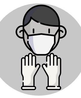
Wear gloves and a dust mask before cleaning