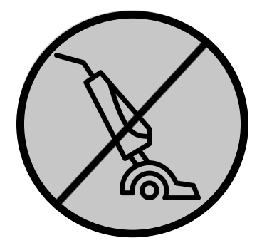
Never use a vacuum cleaner or broom to clean dropping or nesting materials