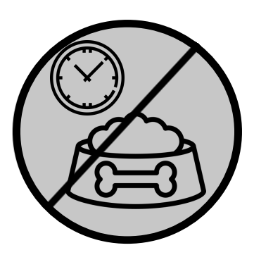
Clean Up Get rid of possible rodent food sources