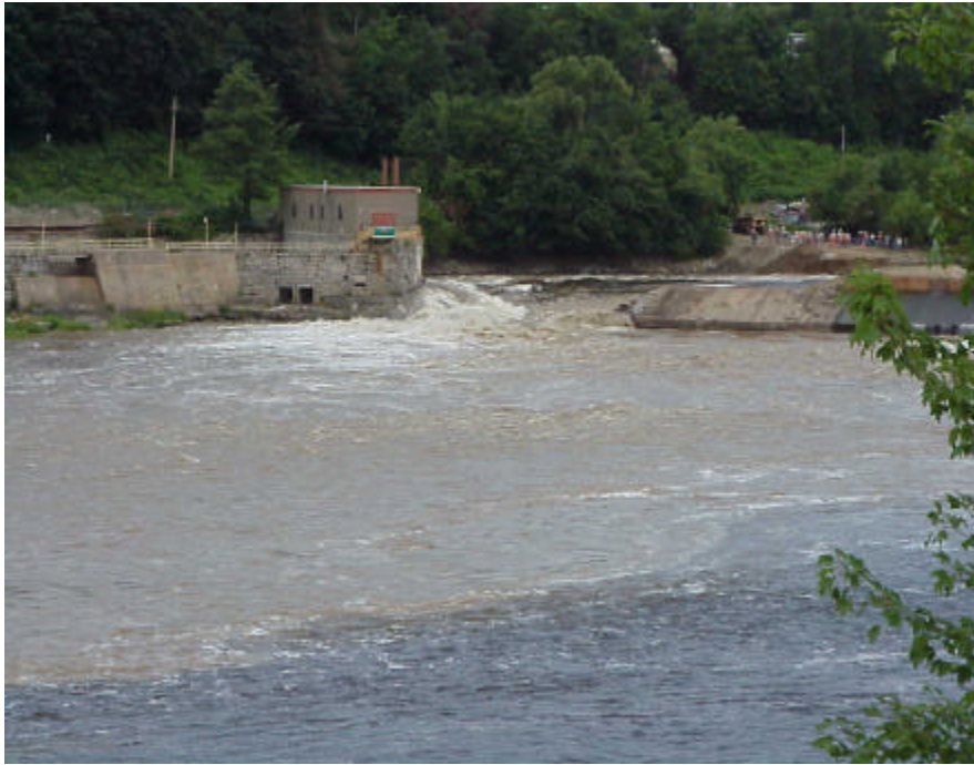
Breaching of the Edwards Dam, July 1, 1999

The Kennebec River is the third largest river in Maine consolidating the flows from many large lakes in north-central Maine, then flowing south through agricultural areas and small towns and cities of the central part of the state to merge with the Androscoggin River at Merrymeeting Bay.