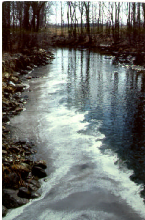
Corinna Sewer District outfall, E. Br. Sebasticook River, about 1980

The Corinna case was particularly important in the evolution of Maine's biological monitoring program. It became the leading example, presented to the Legislature in 1986, why the state needed to have biologically based water quality standards and criteria. The complexities of water quality management in waters like the East Branch required the state to have tools that could integrate and express the effects of multiple stressors on the aquatic community, something that cannot be efficiently accomplished through narrowly focused management tools like wastewater discharge licensing.