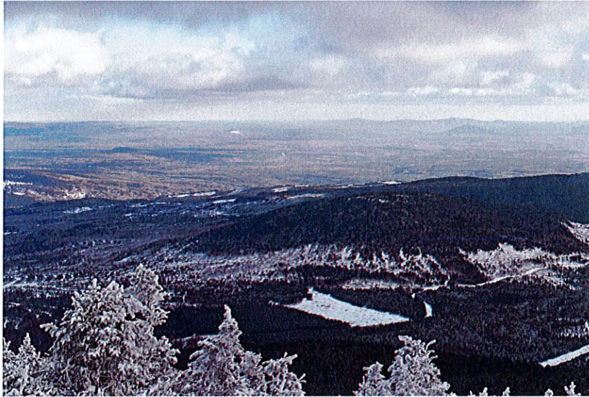
Figure 2: View From Coburn Observatory Looking East With Tapered Vegetation Management