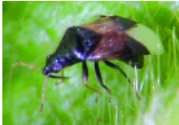
Minute pirate bug