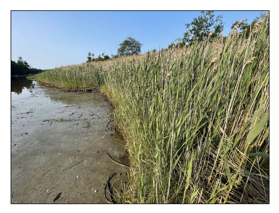
Area A, outer edge.