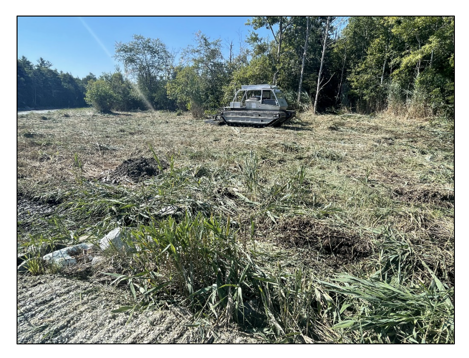
Area A, mowed on August 24, 2023.