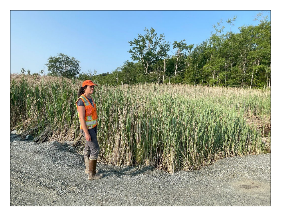
Area A, July 12, 2023. On temporary dam/access road.