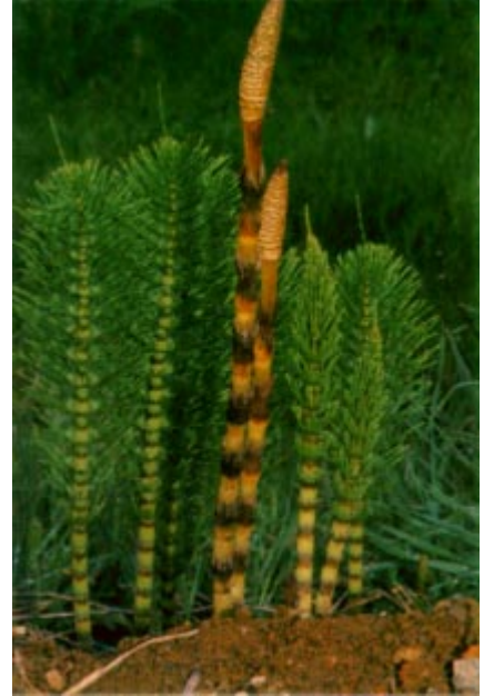
Figure 3.—Giant horsetail often grows in areas where the ground has recently been disturbed.