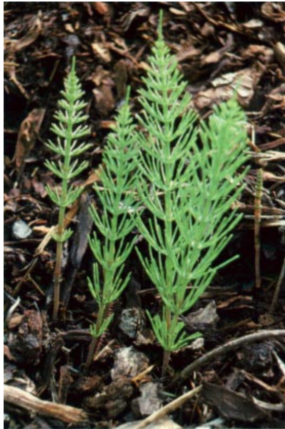
Figure 1.—Field horsetail.

Several species of horsetail and scouring rush are found in the Pacific Northwest. They are perennial, non-flowering plants that reproduce by spores. The spore-producing portion (cone) of the plant contains thousands of dust-like spores equipped with spring-like appendages that uncoil as the spores dry,