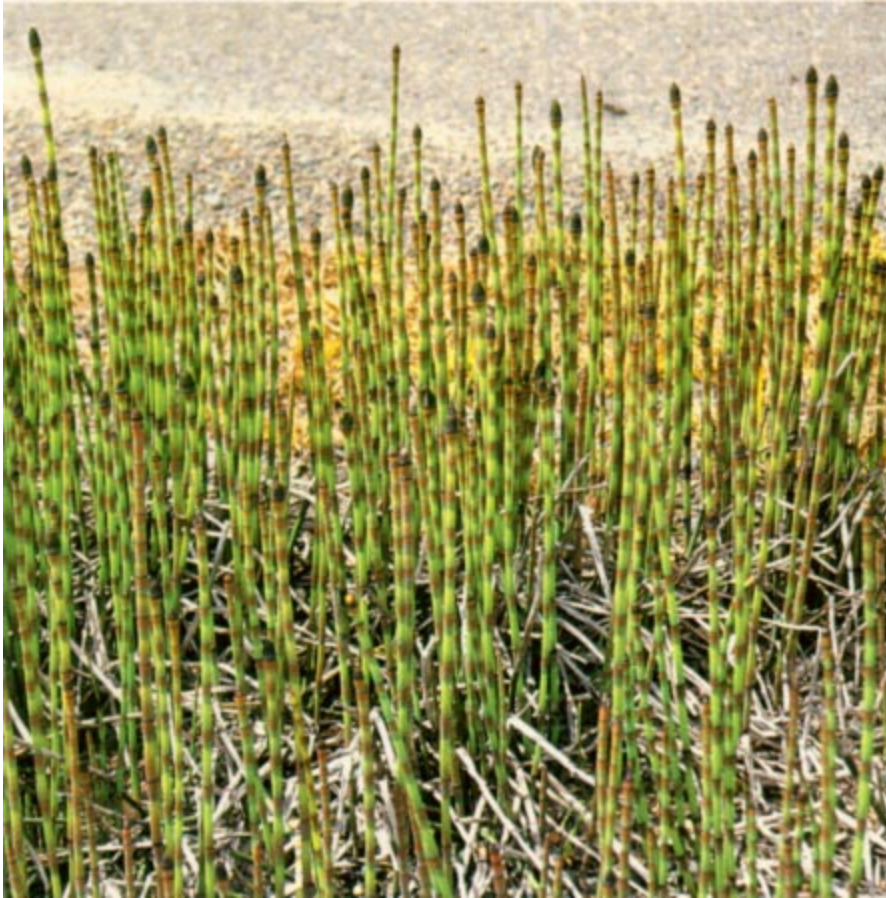
Figure 2.—Scouring rush often grows on roadsides.