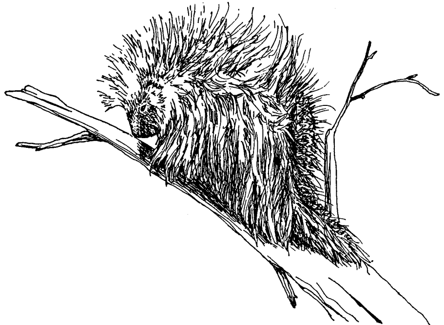
Fig. 1. Porcupine, Erethizon dorsatum