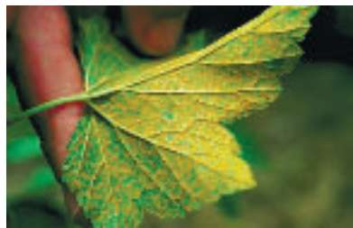
Figure 6. Underside of Ribes leaf with fruiting bodies.

On the alternate host, the aeciospores enter the stomata of the leaf during wet weather. Diffused, yellow spots become visible on the upper leaf surface soon after infection occurs. Within a few weeks, pustules form on the leaf underside and release spores that repeatedly infect the same plant or other Ribes in the vicinity (Fig. 6). This repeating stage serves to increase the levels of inoculum. In late summer, small, brown, hairlike structures appear on the underside of the leaf. Eventually, basidiospores are produced and wind dispersed back to susceptible pines in the vicinity.