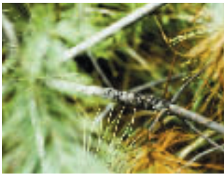
Figure 3. Elliptical cankers formed after the first year of infection.