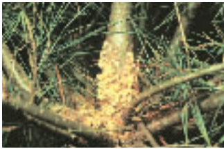
Figure 4. Mass of powdery, yellow spores covering the surface of the canker (spring).