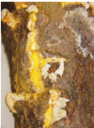
Figure 5. Sticky, yellow liquid exuded by a canker just before hardening off.

The fungus grows into the bark tissue at a rate of 5–6 inches (12.5–15.0 cm) per year and begins to form cankers after the first year of infection (Fig. 3). In spring, 3–4 years after the initial infection, pale yellow or cream-colored blisters (aecia) rupture through the bark of active cankers (Fig. 4). They release powdery, yellow spores (aeciospores) that are carried in the wind over long distances to the alternate host and cause infection. The aeciospores can only infect Ribes species. After the spores are released, the cankered area on the pine remains swollen and roughened. In summer, the sticky, yellow fluid that exudes from the site hardens and leaves small, brown-rust-colored scars (Fig. 5).