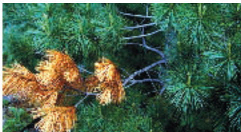
Figure 1. Flagging as a result of cankers girdling a branch.