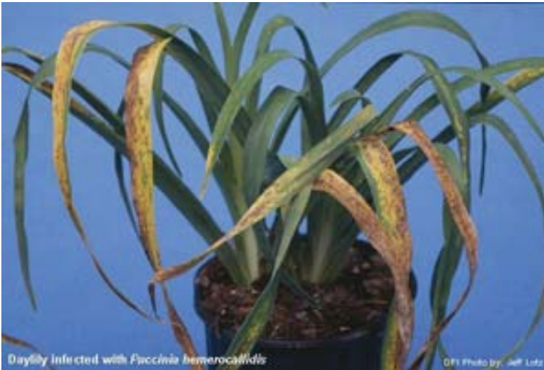
Daylily infected with Puccinia hemerocallidis