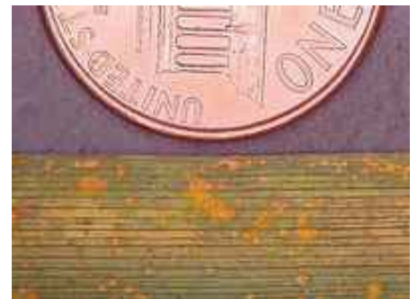
Daylily rust on 'Lord of the Storm' daylily (penny shows relative size), from Indiana's Plant & Pest Diagnostic Laboratory.

Daylily rust was found in the U.S. for the first time in the summer of 2000, in nurseries in the southeast. Infections were confirmed in Georgia, Florida, Alabama and South Carolina. The disease appears to be spreading rapidly (probably from plants moved in interstate commerce, in addition to natural, wind-assisted spread) with the first case in Indiana confirmed in early August from a 'Lord of the Storm' daylily in Floyd Co. Other states reporting daylily rust this year are California, Kansas, Kentucky, Louisiana, Minnesota and Mississippi. According to the USDA, 15 states have now reported finding it either in nurseries or in private gardens.