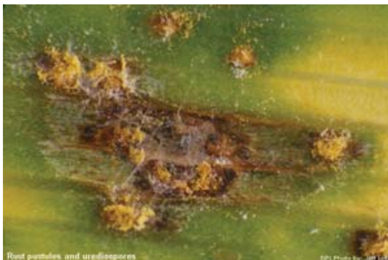
Rust pustules and urediospores