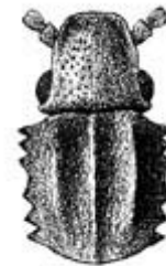
Merchant Grain Beetle