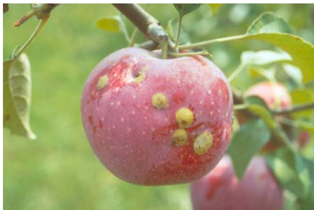
Figure 2 Late season fruit scarring by plum curculio

When the larvae are fully developed, they will leave the fruit through clean exit holes. No frass or webbing will be evident. Frass is usually found around the calyx end on codling moth damaged fruit.