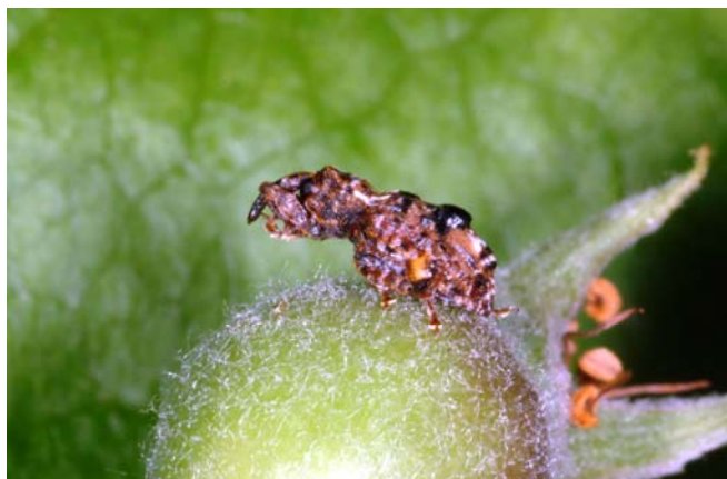
Figure 1. Adult plum curculio on young apple

The adult is a typical snout beetle, 1/4 inch long, dark brown in color with patches of white or gray. There are four prominent humps on the wing covers. The snout is 1/4 the length of the body, with mouth parts located at the end. Plum curculio overwinters in the adult stage in ground litter or soil usually outside the orchard. Adults migrate into the orchards each spring. Often border rows near woods are the first to show injury.