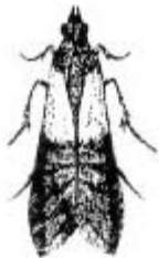
Adult in Resting Position