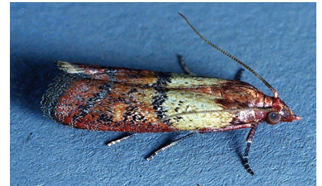
Figure 1. Adult Indian meal moth.

The Indian meal moth ( Plodia interpunctella ) is the most common household moth that can reproduce in Colorado homes. It develops as a pest of various foods commonly found in pantries. The caterpillars can seriously damage susceptible food items and the adult moths can become annoying as they fly through the home.