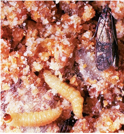
Figure 2: Indian meal moths cause problems on dried food products in the home. Adult and larvae shown.