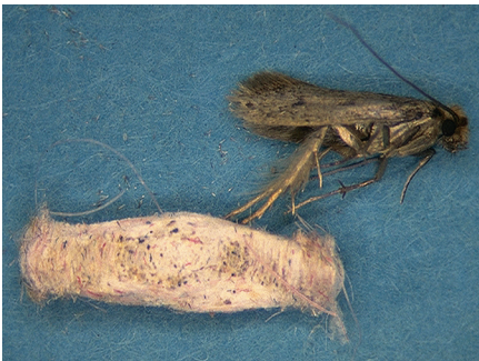
Figure 3. Indian meal moth larva.