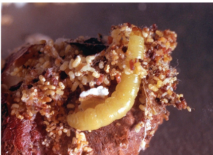
Figure 4. Indian meal moth larva.

which they pupate and subsequently transform to the adult stage. Cocoons are most often located in cracks or confined spaces, such as the junction between walls and ceiling.