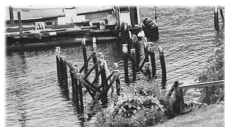
Southwest Harbor 2024