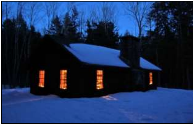
The original Ski Shelter was built as part of a federal recreation area.