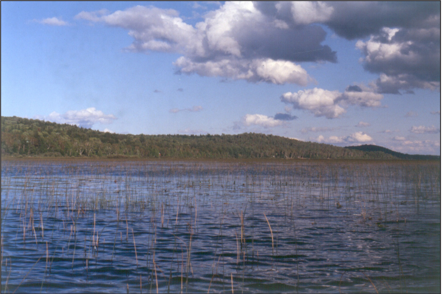
Portage Lake, Maine Natural Areas Program