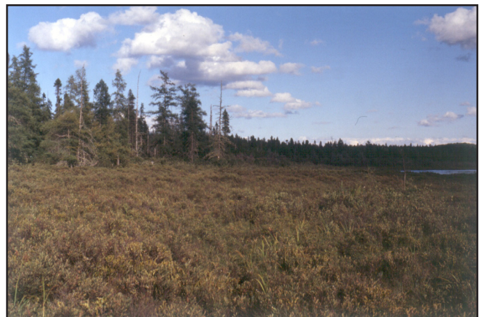
Portage Lake Fen, Maine Natural Areas Program