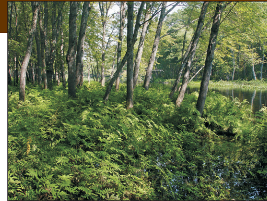
Silver Maple Floodplain Forest

Northern waterthrush, barred owl, belted kingfisher, bank swallow, and green heron are associates of this community type. In the southern part of the state, the Louisiana waterthrush and yellow-throated vireo are likely associates if the canopy is closed or nearly so. Rare turtles like wood, spotted, and Blanding's turtles may feed on amphibian egg masses present in isolated pools within such forests. Wood turtles overwinter in river channels and forage in floodplain forests. The silver-haired bat often roosts in riparian habitats in trees with loose bark.