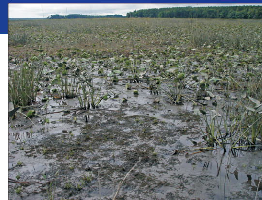
Freshwater Tidal Marsh

Tidal marshes provide valuable wildlife habitat and have received considerable