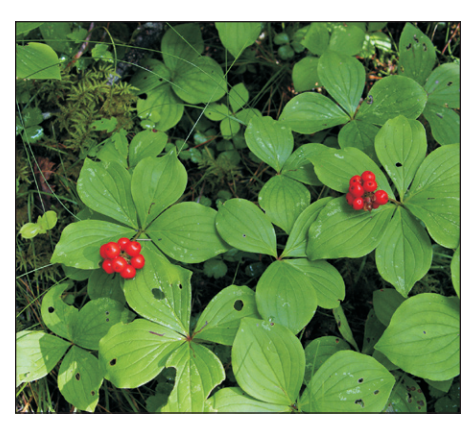
Bunchberry in Fruit

Sites are upland or transitional wetland-upland and are on flat or