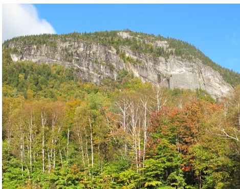
The Eyebrow Cliff, with an ~800’ vertical drop. Note: These cliffs are closed to rock climbing.

Access to the Old Speck and Eyebrow Loop trail is on the West side of Route 26 at the north end of Grafton Notch State Park. Although this guided hike begins on the Appalachian Trail, one may choose to begin on either trail. Note: The Eyebrow trail has some steep areas with metal climbing rungs that may not be suitable to children or pets.