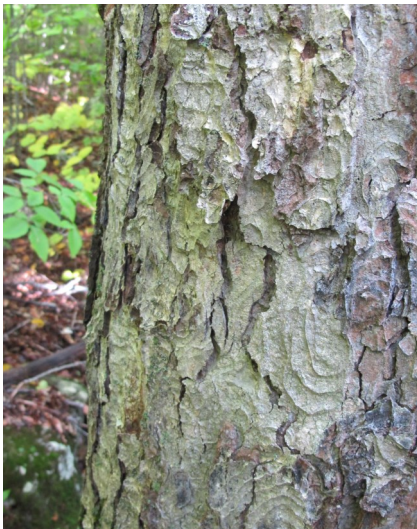
The bark of yellow birch is highly patterned in old trees.

At ~2600 ft. elevation, these cliffs have an ~800 ft. vertical drop, and formed during the last period of glaciation by the freezing of meltwater in rock fissures . This melt-freeze action has tremendous force, capable of breaking off chunks of rock such as those that are now scattered along the valley floor.