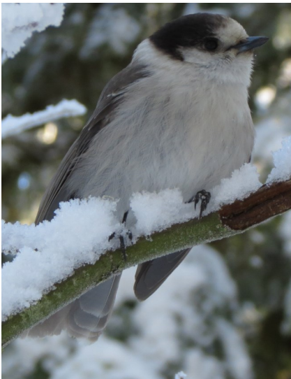
Gray jays are common in North American boreal forest from Alaska to Maine.