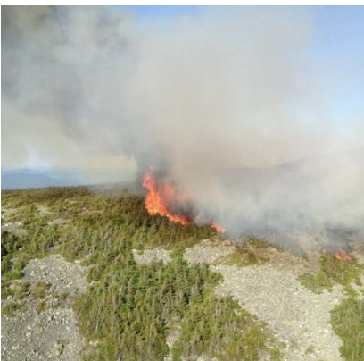
Wildfire is responsible for many of Maine's open summits.

build soil and reclaim these less steep areas of barren rock.