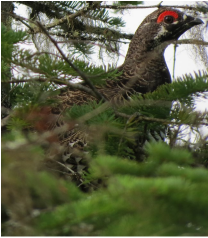
In Maine, spruce grouse primarily feed on spruce and fir needles.