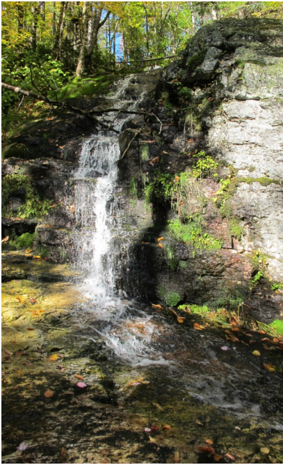
An area of placid waterfall marks the transition between hardwood and softwood forest.