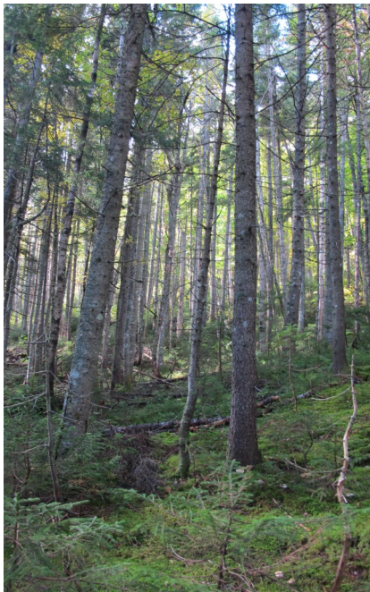
Moist montane spruce-fir forest (above) often will have moist carpets of mosses and liverworts ideal for fungi (below).