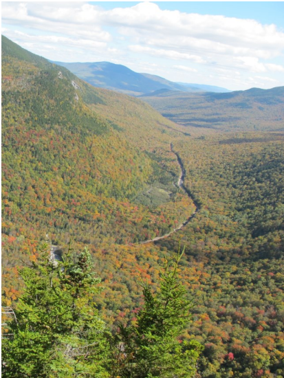
View from Eyebrow cliffs of glacially carved, U shaped Bear River valley.

fires do occur in Maine. In 2016, a lightning strike on Mt. Abraham (west of Kingfield) started a wildfire that burned over 40 acres of the mountain's southern summit before it was extinguished.