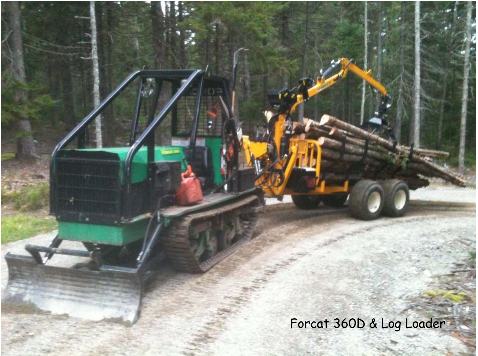
Forcat 360D & Log Loader