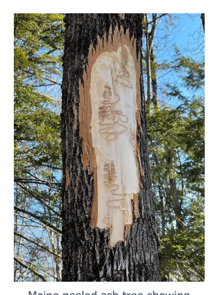
Maine peeled ash tree showing emerald ash borer damage

Although you cannot control the arrival of emerald ash borer on your property, you can decide what impact emerald ash borer will have by developing an emerald ash borer plan. This should be done regardless of proximity to known emerald ash borer populations. The first step is to stay informed about known emerald ash borer populations in the state (<a href="www.maine.gov/eab">www.maine.gov/eab</a>). Next, determine if you have ash trees, their size, location, and if they add value to your property or community. Determine if your trees are on personal or public property. If public, contact your local municipal office to see if an EAB management plan is in effect. To estimate the costs associated with tree removal, replacement or treatment of private trees, use local foresters and arborists, smartphone apps (ARBOR-mobile for iPhone and iPad and others) or online calculators (<a href="https://int.entm.purdue.edu/ext/treecomputer/">https://int.entm.purdue.edu/ext/treecomputer/</a> and other sites). Once you have determined your investment in ash and considered your budget, you can develop a plan for which trees will be removed, replaced or treated with insecticides when emerald ash borer arrives. A plan empowers you to make informed decisions about your property or community.