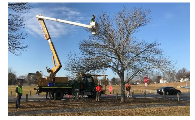
Branch sampling of an ash tree