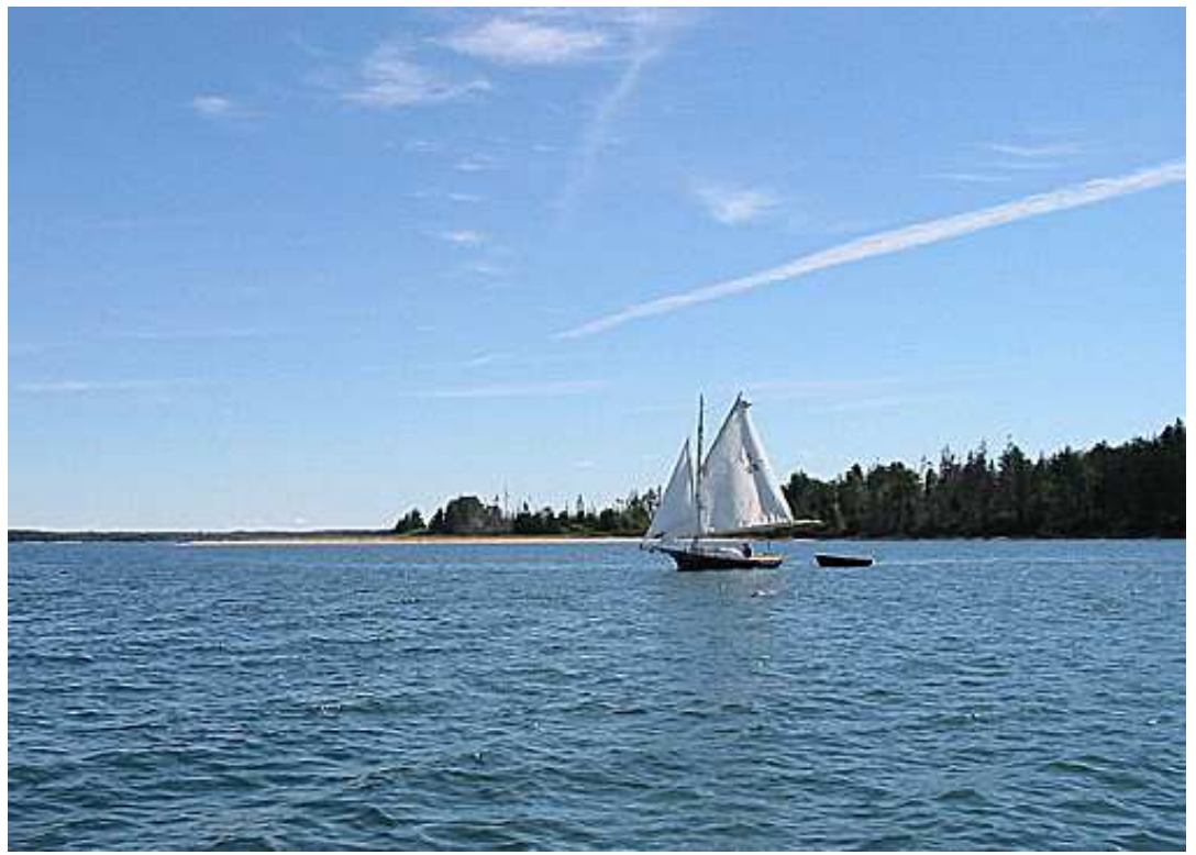
Sailing near Marshall Island

The Commission will undertake other actions from time to time to more fully implement the goals and policies of this Plan.