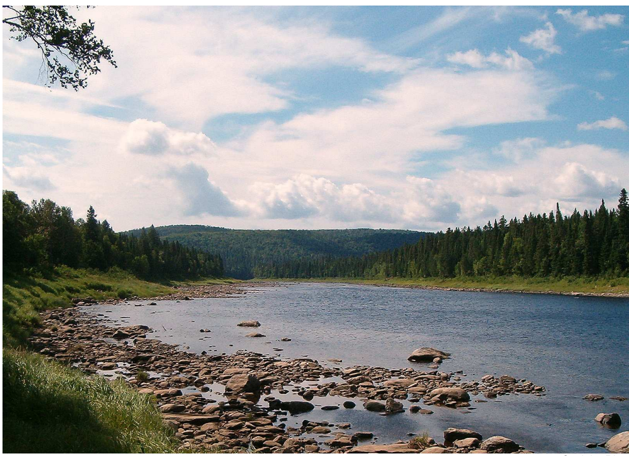
St. John River