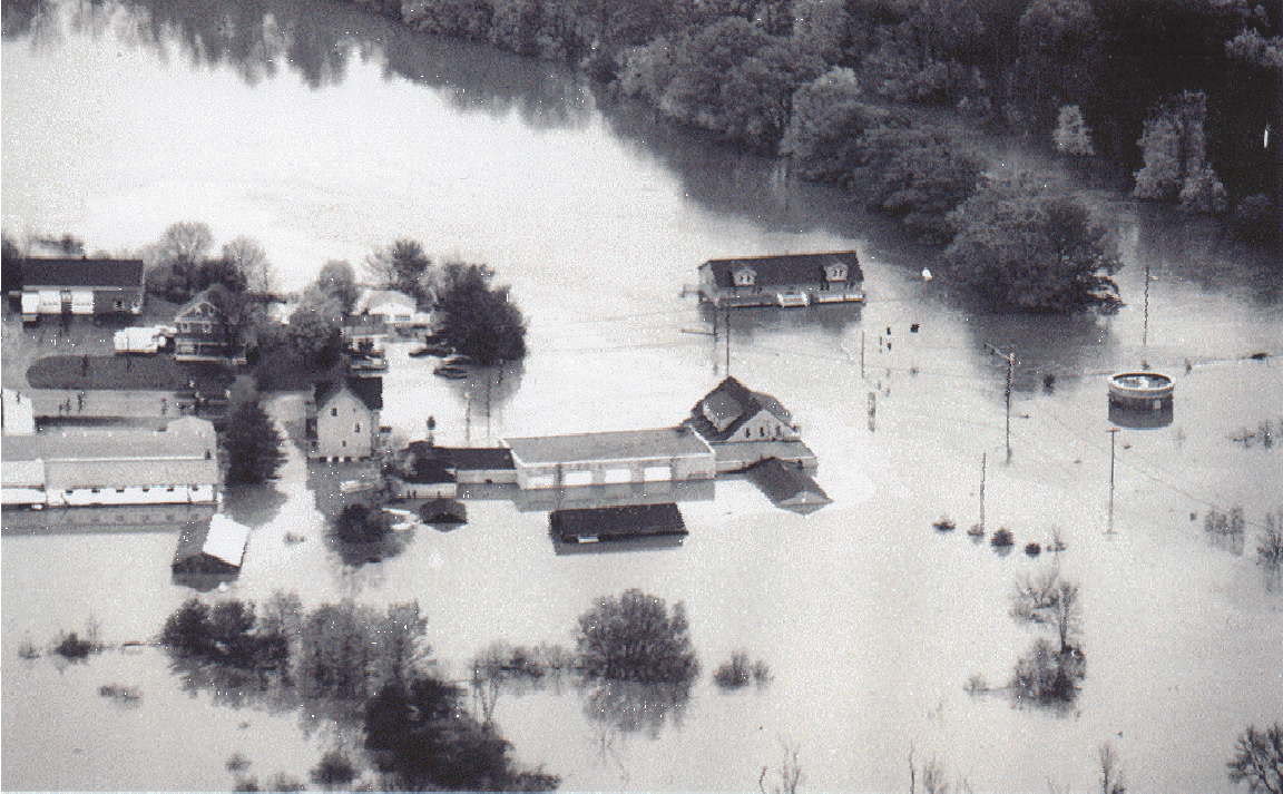
Aerial view of the Presumpscot River at the intersection of Route 302 in Westbrook, Maine on October 22, 1996.