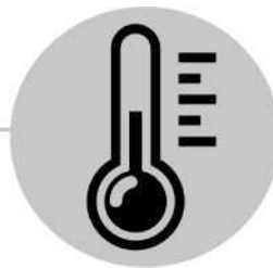
Fievre ya makasi te